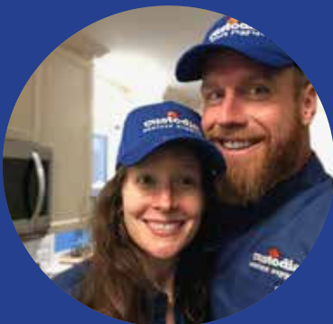
Founder of Custodia